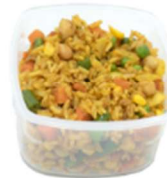
Vegetable fried rice