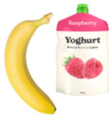
Banana Reduced fat yoghurt